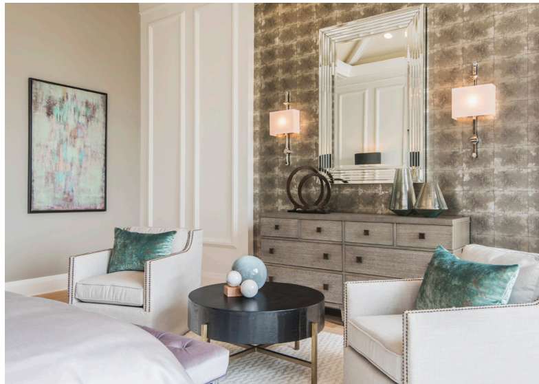
Wallpaper regains its place in the spotlight, showing up on accent walls in patterns like this vintage mercury glass from Zoffany's Anthology Collection.

Homes in Bella Collina start in the $470,000s, with Villa Calabria to be listed at $2,350,000. ●