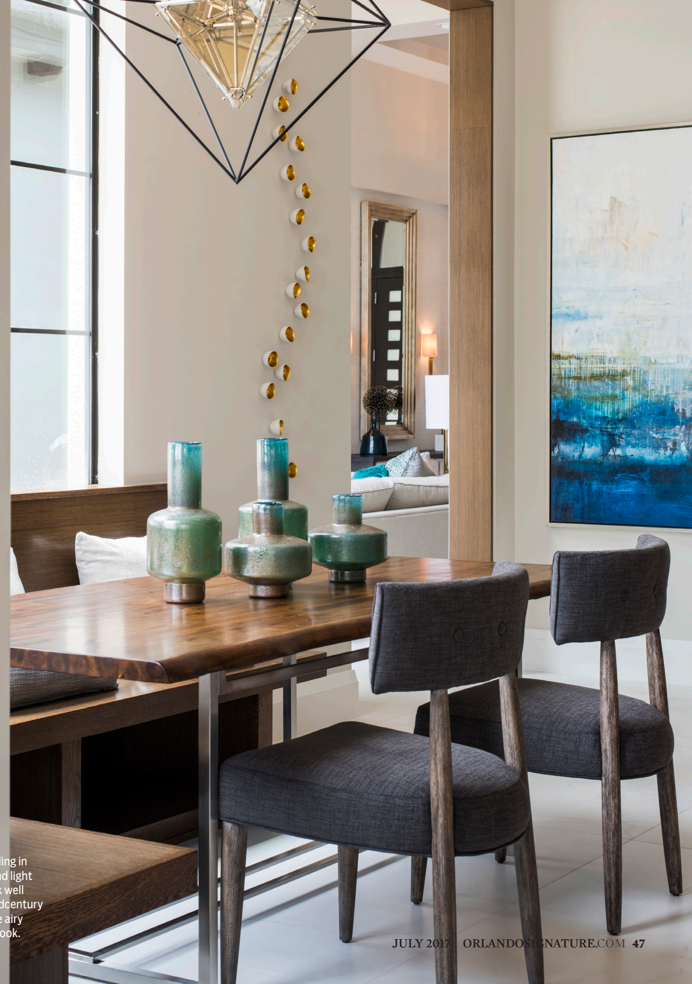
Metal detailing in the table and light fixture work well with the midcentury chairs in the airy breakfast nook.